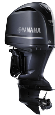
F350TXR / LF350TXR